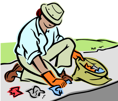
Making a difference in the community

The Volunteer & Service Center at Cal State Fullerton was established in 1995 as the Community Service Action Team. Last year alone, over 2000 students were placed in community and service-